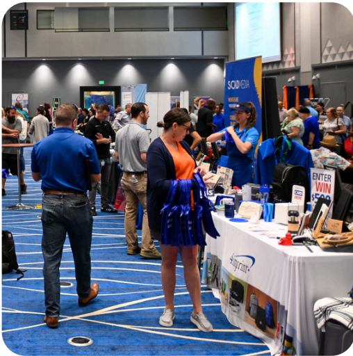
Annual UF Small Business Opportunity Fair where small businesses market themselves to UF and other exhibitors.

Aligning with the Council's strategic goal of supporting supplier development events across the state to increase access to resources, including collaboration with other agencies, the below photos showcase council members supporting small businesses at supplier events.