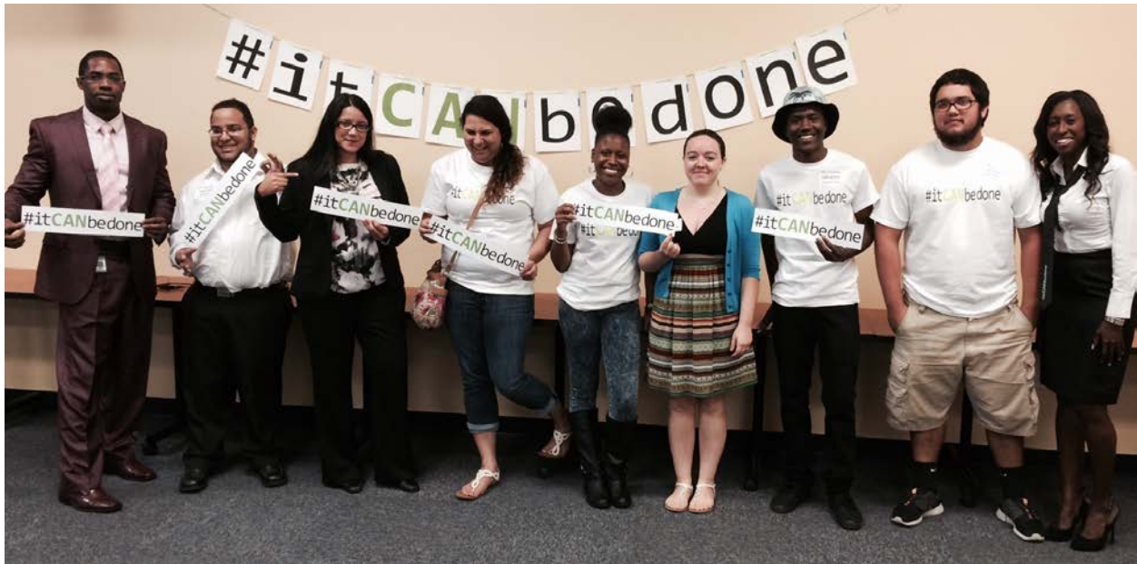
Photograph of the Suncoast Region #itCANbedone campaign launch