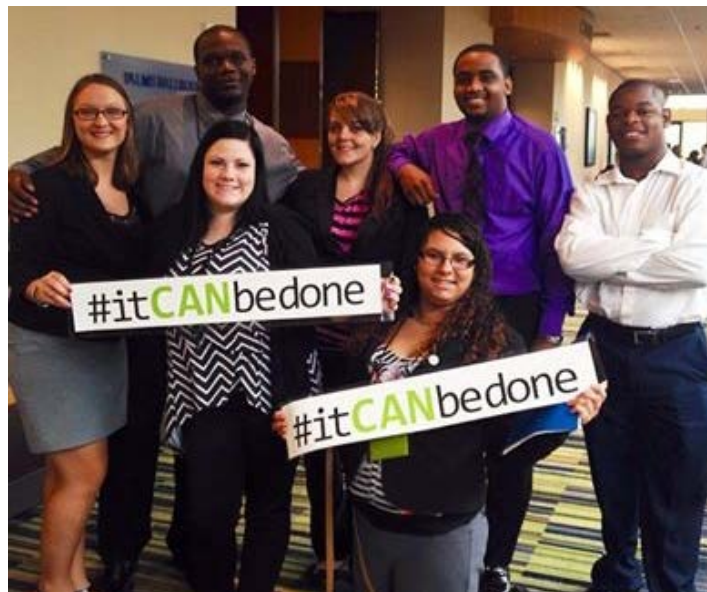
Photograph of Independent Living Young Adults at the 2014 Child Protection Summit

Youth participating in this workgroup would be requested to participate in one additional substantive workgroup, such as the group care, employment, education, or juvenile justice workgroups.