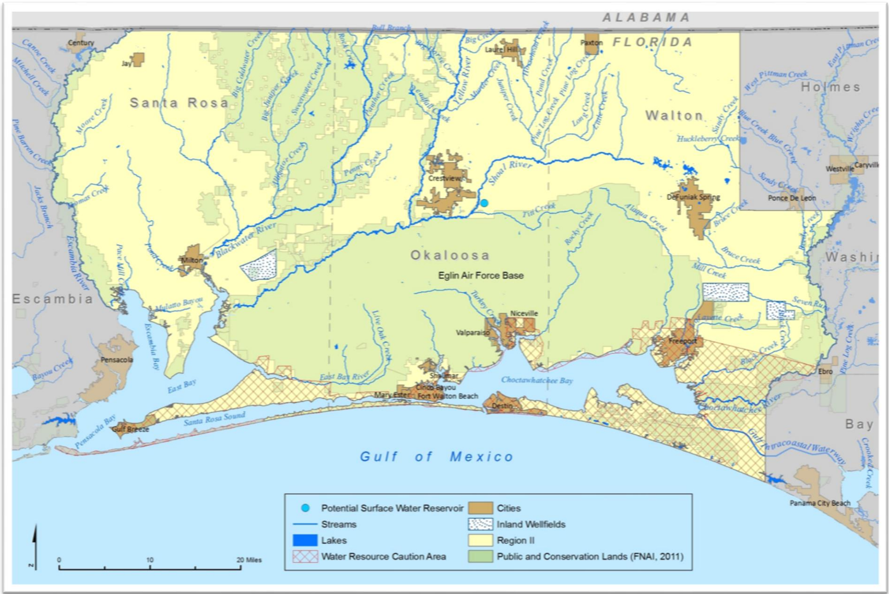
Figure 2. Water Supply Planning Region II