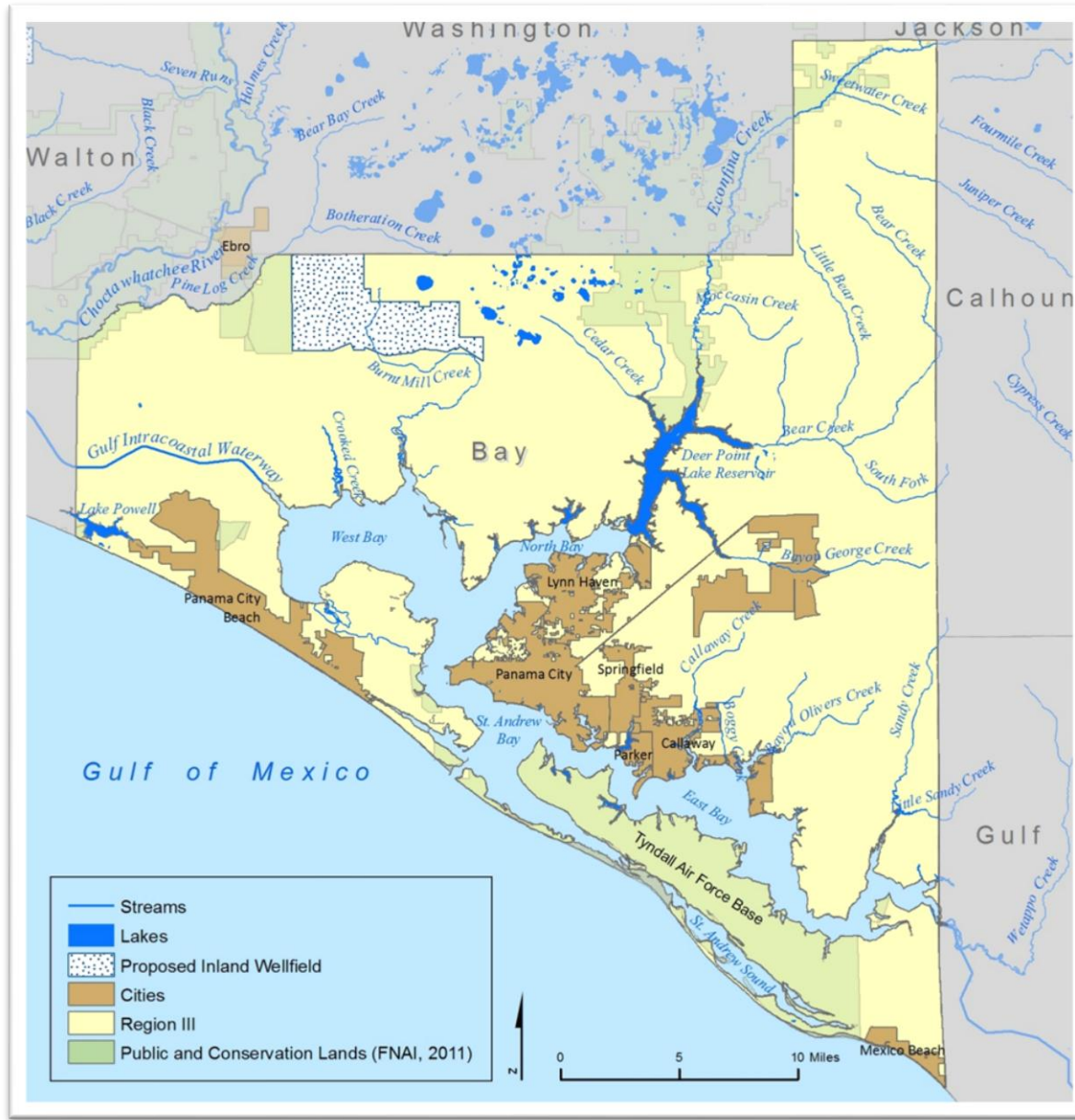
Figure 3. Water Supply Planning Region III