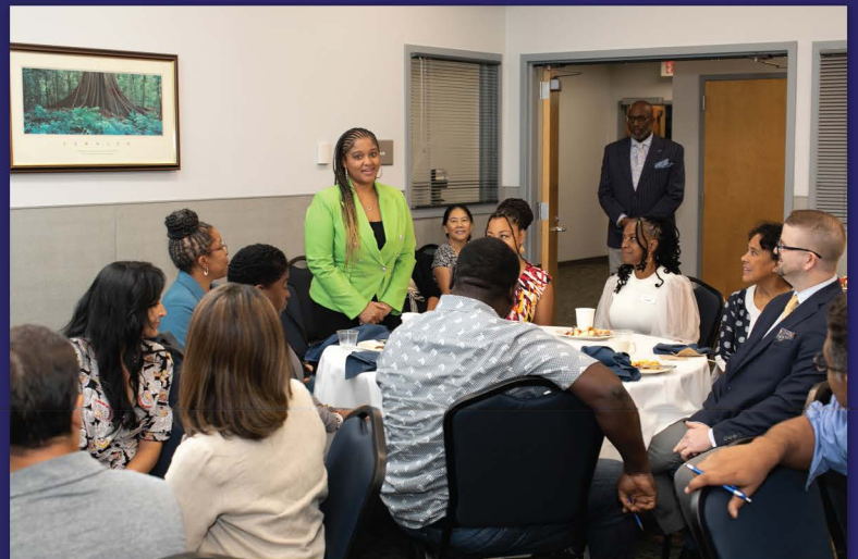
Florida SBDC's UNF region held their MEDWeek Annual Luncheon and MEDWeek Annual Breakfast back in August