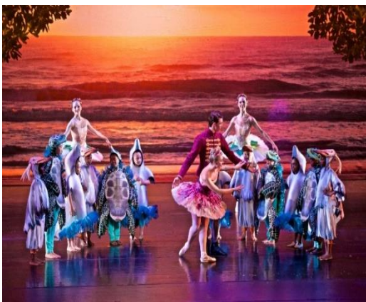
Ballet Vero Beach

Chapter 265, F.S. directs the Division of Arts and Culture to accept and administer state and federal funds appropriated by the Legislature; enter into agreements for awarding grants or other contracts with any person, firm, performing arts company, educational institution, arts organization, corporation and local government; and to provide programs to support works and performances of Florida artists, activities of art agencies, museums and cultural nonprofit organizations to ensure that arts and culture have a significant and positive effect on Florida residents. The Division of Arts and Culture is Florida's legislatively designated state arts agency, which enables the drawdown of federal funds from the National Endowment for the Arts. The Division launched its 2020-2025 Strategic Plan in January 2020. The plan allows the Division to continue its advancement on three key goals which support the Governor's