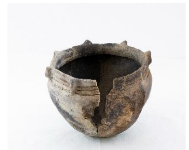
Figure 2 – Prehistoric Native American Bowl

The Division’s relocation of the state’s archaeological collection into a state-owned facility at the Department of State’s Mission San Luis, continues to realize annual savings. Containing over 1.3 million artifacts, such as this Prehistoric Native American bowl (Figure 3), the state’s archaeological collection grew by approximately 175 boxes of artifacts and associated archives during FY 2020-2021. The Division conserved 127 artifacts, including metals, organics, glass and ceramics, from small beads to large cannons and anchors. From FY 2021-2022, the conservation lab made strides toward bringing the lab up to standard with new equipment.