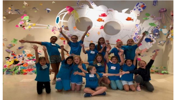
Lighthouse Art Center

Arts and Culture Grants – The Division’s programs contribute to economic development goals by spurring community development, influencing business relocation and promoting cultural tourism. In FY 2021-2022, Arts and Culture Grants managed by the Division of Arts and Culture stimulated more than $1.5 billion in direct economic activity within the state, directly creating more than 5,700 jobs while supporting over 15,000 existing jobs, resulting in a dramatic return on investment.