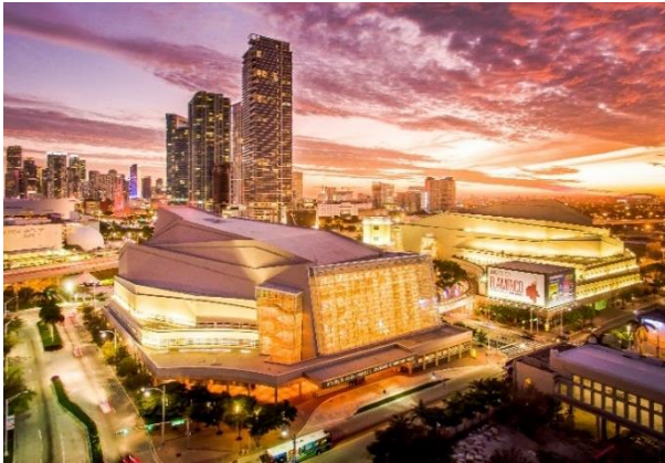
Adrienne Arsht Center for the Performing Arts of Miami-Dade County

participate in a national college scholarship competition. New for FY 2021-2022, the Division partnered with the office of Lieutenant Governor Jeanette Nuñez for the first Space Art Contest.