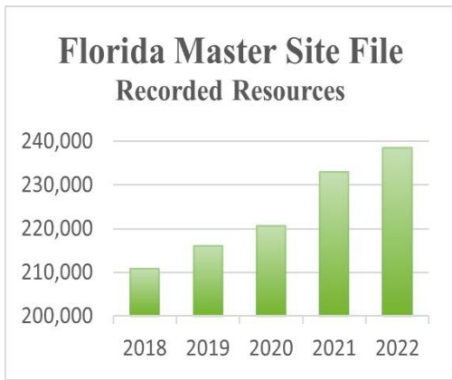
Figure 3 - Five Year Growth

Many of the state’s most significant sites are recorded in the Florida Master Site File, the official statewide digital “inventory” of over 238,000 historical and archaeological sites and resources across Florida. It is the Division’s goal to increase public access to data in the Florida Master Site File. The user-friendly version of the on-line inventory with expanded search capabilities continues to enhance data queries. The in-house version of the Site File database provides easier access to data and increases turnaround time for client requests. Florida Master Site File website application log-ins topped 21,000 this year. Updates made to the electronic site recording forms continue to improve data quality and increase staff efficiency. Recordings in the Site File are growing at an average of 6,424 annually (Figure 4).