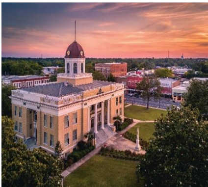
Figure 4 – Quincy Main Street

The Federal Historic Preservation Tax Incentives Program administered by the National Park Service in partnership with the Division of Historical Resources is the nation’s most effective program to promote historic preservation and community revitalization through historic preservation. In 2020, Federal Tax Incentives for Rehabilitating Historic Buildings generated over $3.2 million in rehabilitation investment of income-producing historic properties in Florida.