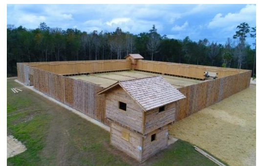
Figure 5 – Fort King Reconstruction

The Historical Resources Grants program has had positive economic effects by helping create and/or sustain jobs in the manufacturing, retail, services, and construction sectors, and also by encouraging the growth of heritage tourism through renovation and revitalization of Florida’s historic resources and sites, such as reconstruction of Fort King (Figure 6). The Division’s stewardship of historical resources will continue to contribute to the economic well-being of Floridians. State funding for local historic and archaeological preservation projects leverages financial support, as state grant awards require local cost share and matching funds. Historic preservation projects also enhance property values, create affordable housing, and augment revenues for the Federal, state and local governments.