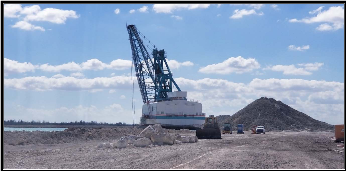
WRQ mining operation - A dragline excavating limerock

The District owns land adjacent to a limerock mining operation in the Lake Belt area of Miami-Dade County that is leased to White Rock Quarries (WRQ). The District entered into a ten-year lease agreement that includes 3 five-year extensions with WRQ on April 12, 2006 to allow the company to mine, quarry, and process limerock on District land, which is used for road construction, asphalt pavement, and ready-mix concrete products. The District purchased the majority of this land on December 9, 1996, for $2,350,000.