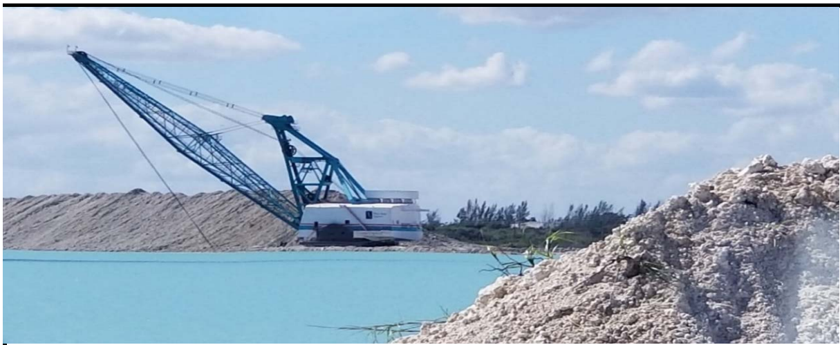
Excavated above ground limerock pile

2016 through April 10, 2018, which are significantly less in scope than an audit and do not meet the intent of audit requirements in Section 2(i) of the lease agreement. Agreed upon procedures engagements only require the CPA to present their results as “findings”, but do not require attesting to those findings. Hence, the accountant’s reports for the periods ending April 10, 2016 through April 10, 2018 do not express an opinion on the royalty payments and as a result we did not place any reliance on the accountant’s report. It should further be noted that the accountant’s report is based on the survey data contained in the engineers reports but does not attest to the reliance of such data, which is normal in these situations since such knowledge is beyond an accountant’s expertise. Nonetheless, based on our own calculations (which were also based on the engineer’s survey data), we found the findings in the accountant’s report are reasonable.