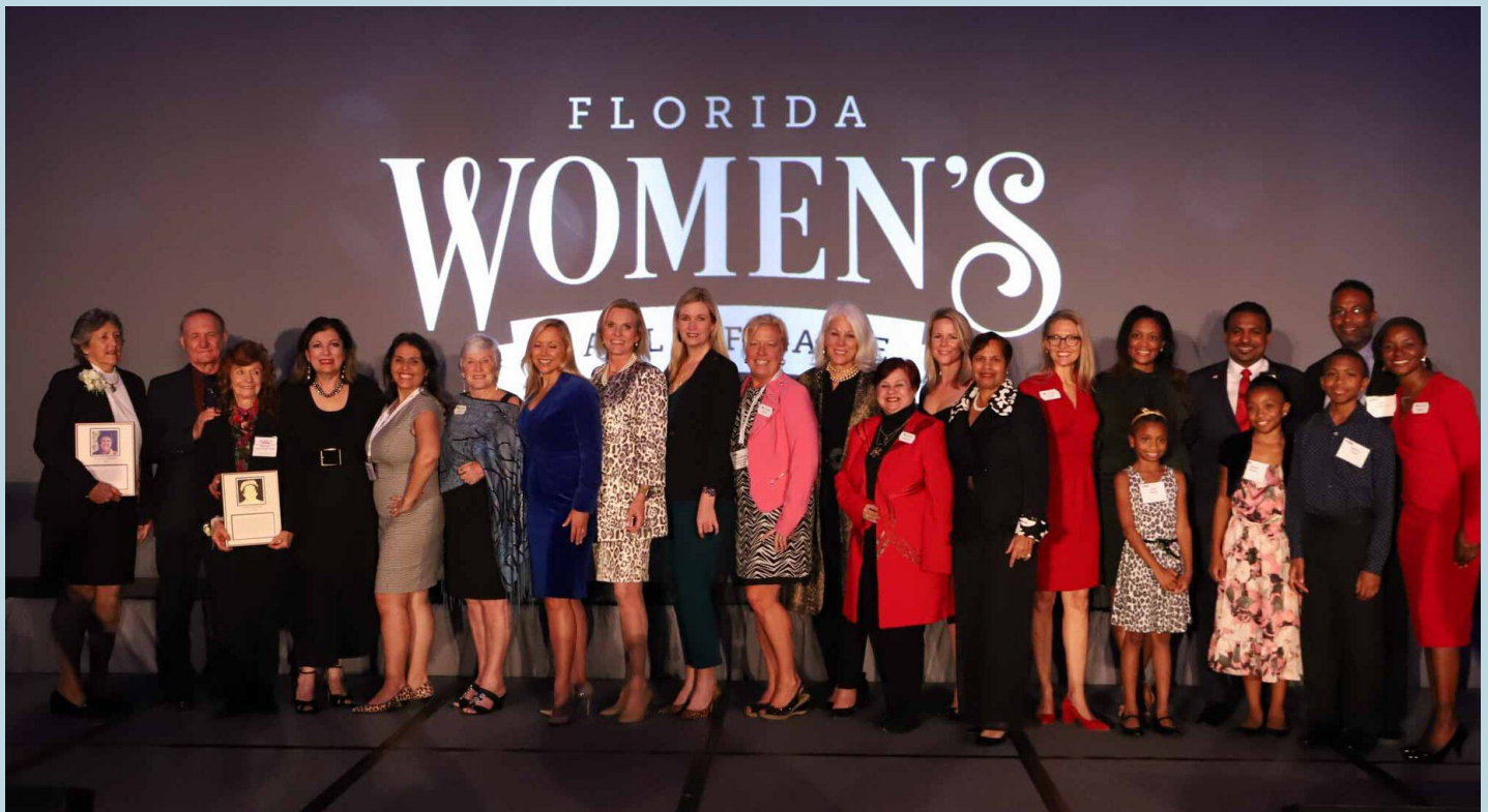
Members of the Florida Commission on the Status of Women, 2019 Women's Hall of Fame Inductees and their families.

By celebrating women's historic achievements, we present an authentic view of history. The knowledge of women's history provides a more expansive vision of what women can do and encourages us all to think larger and bolder.