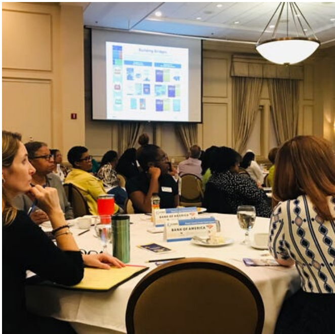
Roughly 135 state and community leaders attended the 2019 Women's Economic Summit hosted by the Tallahassee-Leon County Commission on the Status of Women and Girls and supported by the Florida Commission on the Status of Women.

Economic security, a cornerstone of individual potential, includes having a stable source of income and enough human capital (education, skills, training, confidence, and knowledge) to sustain an