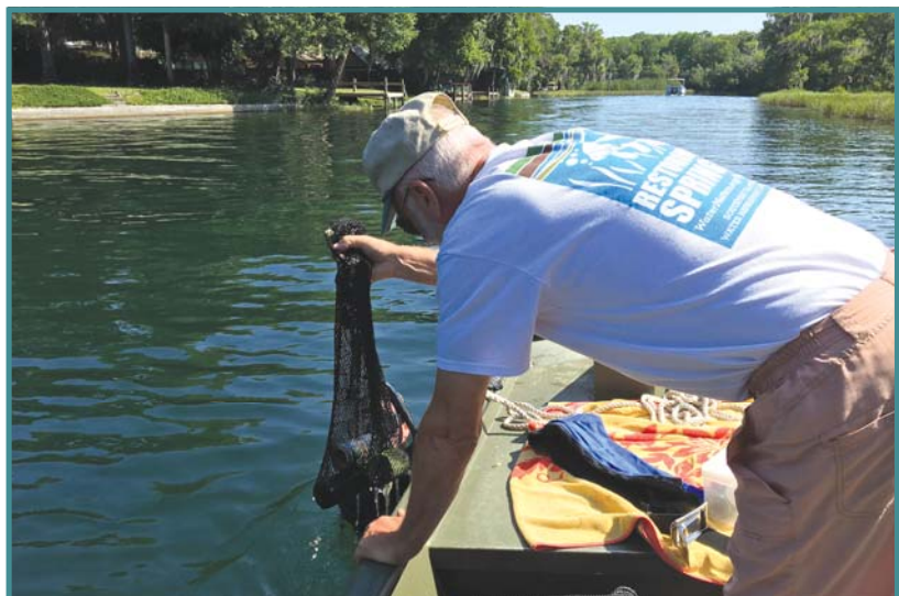
Rainbow River cleanup in Dunnellon