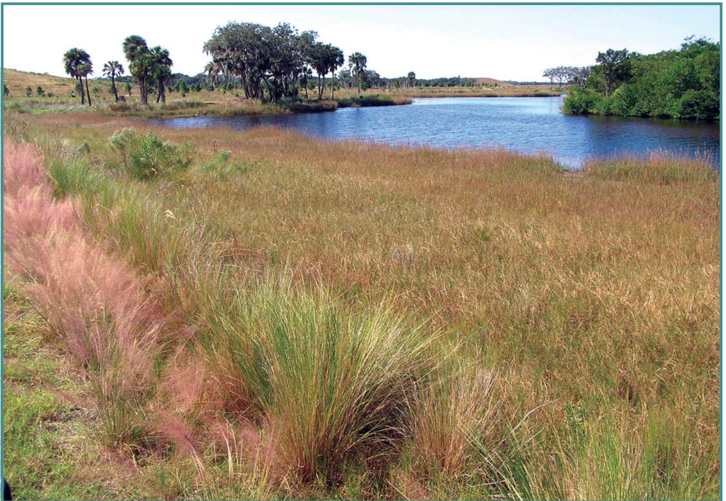
The Rock Ponds project involves the restoration of approximately 1,043 acres of various coastal habitats. This project, which is the largest habitat restoration effort for Tampa Bay to date, was completed in cooperation with Hillsborough County.

the lake and the fate of the nutrients that do reach the lake (e.g., internal nutrient recycling) would help in achieving the targets, which is consistent with implementation of the Lake Seminole Watershed Management Plan.