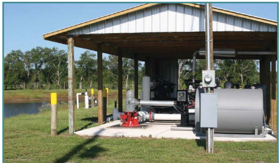
Surface water pump station at Windmill Farms, Hardee County