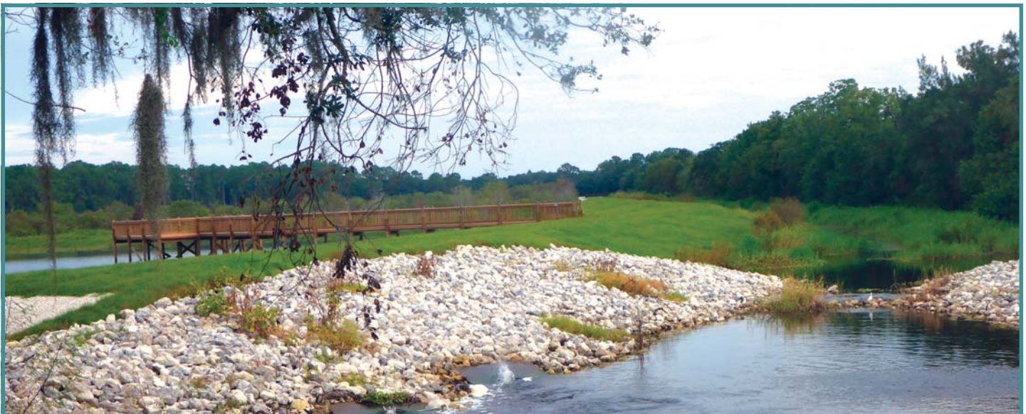
Lake Gwyn, Polk County

As of 2017, the District is initiating an evaluation of the Ridge Lakes to prioritize lakes for further evaluation to determine the projects and programs necessary to ensure that the Ridge Lakes meet the water quality objectives of the District. Success indicators will be measured by water quality improvements including reductions in non-point source loading of nutrients, decreases in nonnative or undesirable species and increases in native aquatic and upland vegetation. In addition, lakes with sufficient water quality data will be evaluated against the DEP's numeric nutrient criteria.