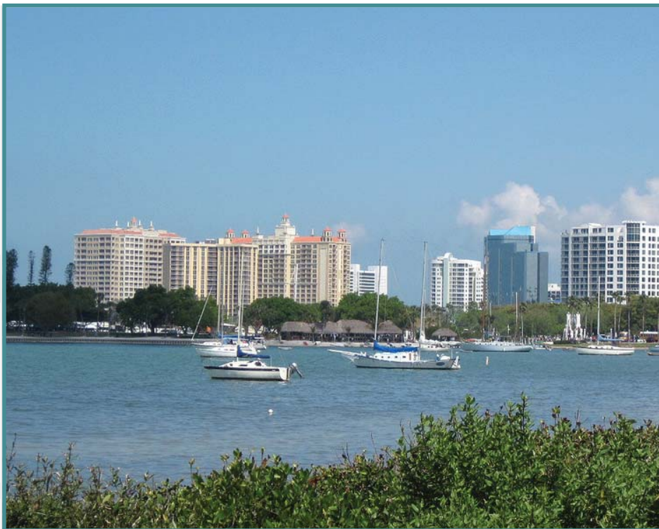
Sarasota Bay

Additionally, analysis of historical surface and groundwater quality conditions in the Shell Creek watershed, along with implementation of BMPs, suggest that the surface waters within Shell Creek may naturally exceed Class I drinking water standards. Monitoring of key locations will continue in cooperation with the DEP.