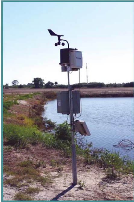
Weather station in Hillsborough County

and pumped 75 percent of this volume over the City of Tampa dam when necessary. To further support recovery of the lower river, the City of Tampa has been supplying up to 18 cubic feet per second of flow from Sulphur Springs to the base of the City of Tampa dam. A project to develop additional augmentation quantities for the lower Hillsborough River from Blue Sink was completed in September 2017. The District is also helping fund the City of Tampa's augmentation project to evaluate the use of reclaimed water to augment water supplies. A recharge/recovery system is being investigated to store and recover reclaimed water in the Floridan aquifer system for subsequent delivery to the Hillsborough River Reservoir.