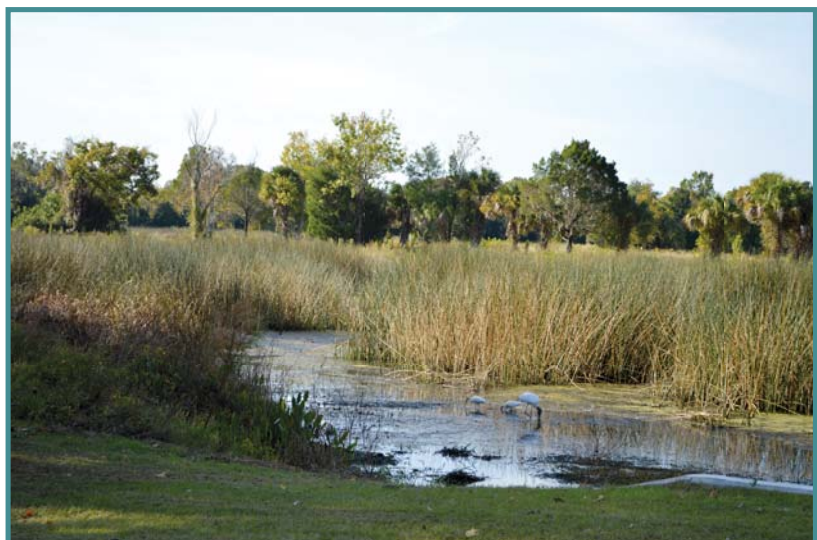
Three Sisters Springs in Crystal River