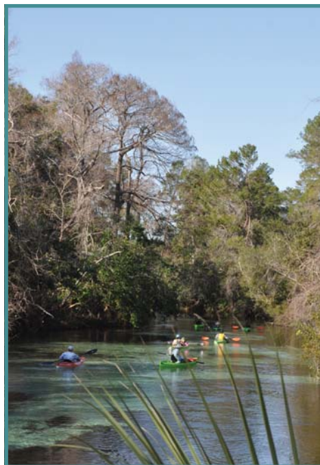
Weeki Wachee River in Hernando County

Each SWIM plan is a road map, a living document with adaptive management at its core. These plans identify management actions, projects that address the issues facing each system, and specific quantifiable objectives to assess overall progress and help guide the SCSC. In an August 2017 workshop, the District's Governing Board prioritized combining District funds with state and local funds for projects that would connect domestic septic systems to central sewer to benefit springs. The Board also identified the need to protect the District's investment by ensuring controls are in place to prevent additional pollution from new septic systems.