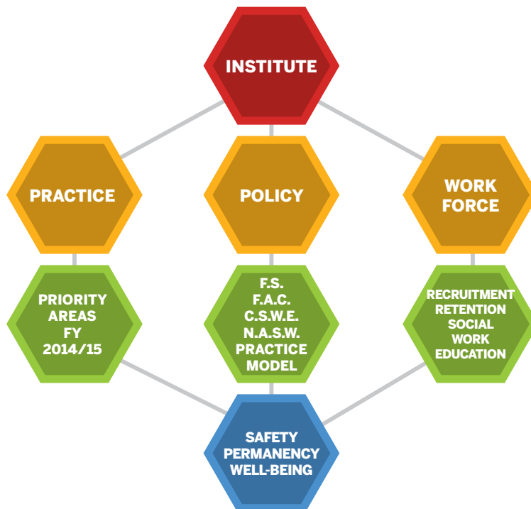
Figure 2 – Conceptual Model for the Institute

Through these meetings and conferences, the Institute gained invaluable insight as to the strengths and needs of Florida's child welfare system and the leadership required from the Institute regarding research and technical assistance. The Conceptual Model for moving forward is illustrated in Figure 2: