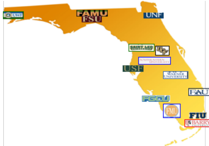
Figure 1: Florida's Public and Private Social Work Programs

The Institute and the Florida Association of Deans and Directors of the Schools of Social Work (FADD) are in the process of working on an affiliate Memoranda of Understanding (MOU). Each participating program will receive a $2500 stipend to offset costs such as faculty travel to Institute meetings.