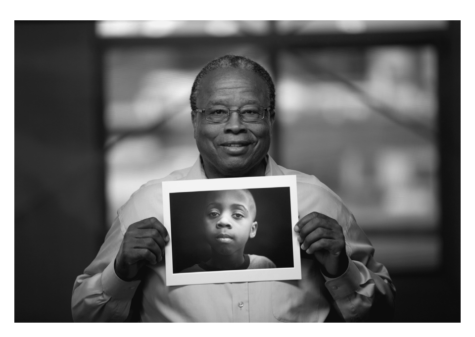
I am for the child.

The children/youth participating in these conversations seemed to picture their GAL volunteer as a friend, mentor, counselor, teacher, advocate, supporter, and cheerleader. This Initiative realizes two outcomes: (1) it documents the success of the Guardian ad Litem Program and the work of its volunteers and (2) it also provides the opportunity for children in foster care to guide the direction of the Guardian ad Litem Program and to improve the organization's ability to meet the child(ren)'s needs.