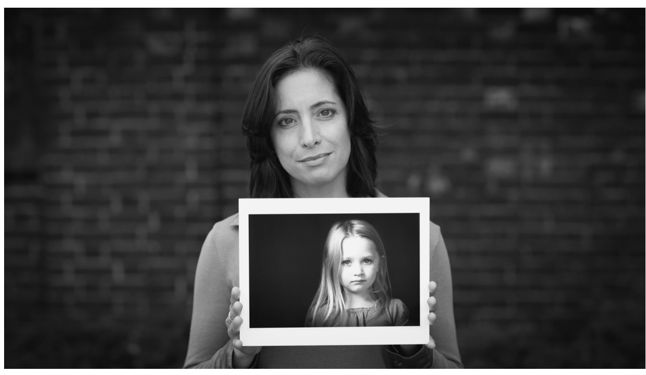
I am for the child.

"I would take my kids to different places they have never been."