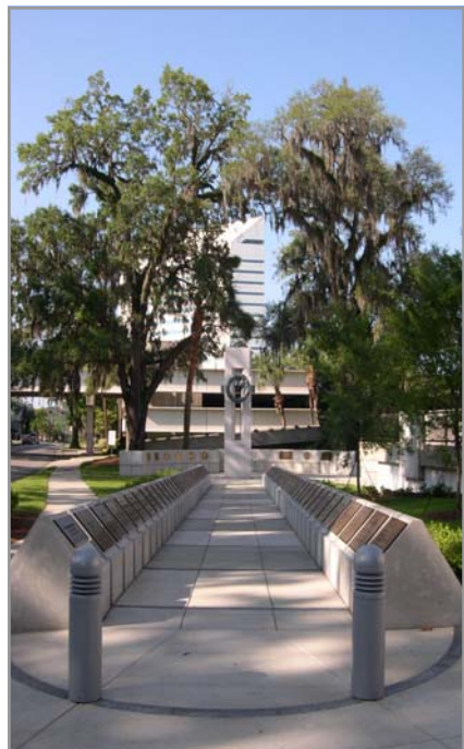
Florida's World War II Tallahassee

FCFA is an independent commission assigned to FDVA as an advisory body. The commissioners are veterans of a war in which the United States was or is a participant. The commission meets four times annually (FS 292.04). Memorial