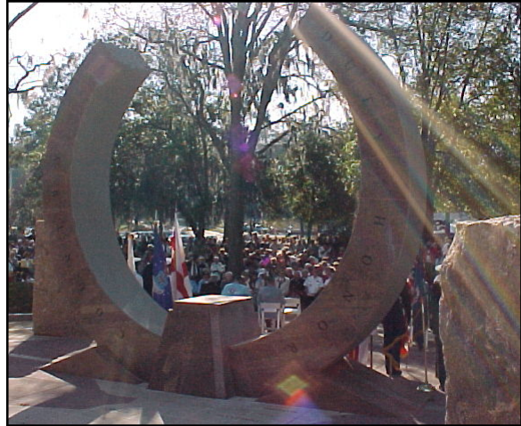
Florida's Korean War Veterans' Memorial Tallahassee

Since 1944, the State of Florida has recognized the need for a state government entity to ensure that Florida's military veterans have maximum access to benefits guaranteed by federal law. In 1988, the citizenry of Florida favorably endorsed a constitutional amendment to create a separate agency, the FDVA, with the charter to provide advocacy and representation for Florida's veterans in their dealings with the USDVA. It is useful to reflect on why Florida has an agency to advocate for veterans. There are two fundamental reasons. The first has to do with the public policy of honoring veterans whose contributions over the years have guaranteed the freedoms we all enjoy in our nation today. The other reason is such advocacy correspondingly increases federal benefits for Florida's veterans, raises the quality of life for veterans with service-connected disabilities, and provides access to federally-funded medical care for eligible veterans.