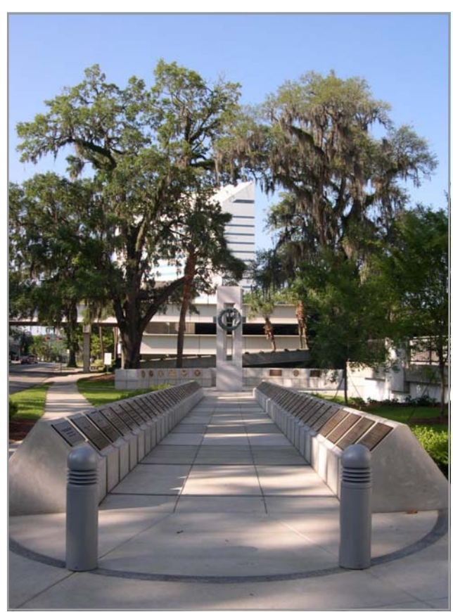
Florida's World War II Monument Tallahassee

FDVA also honors those who served in past wars. On June 6, 2005, the Governor dedicated Florida's World War II Monument honoring the service of Floridians who fought in World War II. The ceremony was held on the 61<sup>st</sup> anniversary of the Allied Invasion of Normandy. The monu-