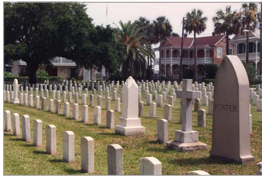
St. Augustine National Cemetery

350,000 veterans live within the area it will serve. On June 14, 2006, USDVA Secretary Nicholson approved the award of the Fast Track construction contract. This new 313-acre cemetery will serve veterans for the next 50 years. It is located in Lake Worth on U.S. 441 just south of Lantana Road and north of Boynton Beach Boulevard. The USDVA named A^2 , a minority contractor from Miami, to complete the fast track construction for early interments. An 8-acre area will be developed and available for burials in Spring of 2007, weather permitting.