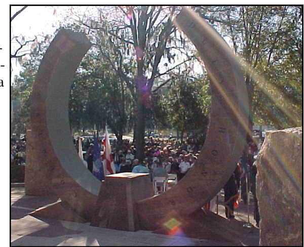
Florida's Korean War Veterans' Memorial Tallahassee

ince 1944, the State of Florida has recognized the need for a state government entity to ensure that Florida's military veterans have maximum access to benefits guaranteed by federal law. In 1988, the citizenry of Florida favorably endorsed a constitutional amendment to create a separate agency, the FDVA, with the charter to provide advocacy and representation for Florida's veterans in their dealings with the USDVA. It is useful to reflect on why Florida has an agency to advocate for veterans. There are two fundamental reasons: The first has to do with the public policy of honoring veterans whose contributions over the years have guaranteed the freedoms we all enjoy in our nation today. The other reason is such advocacy correspondingly increases federal benefits for Florida's veterans, raises the quality of life for veterans with service-connected disabilities, and provides access to federally-funded medical care for eligible veterans.