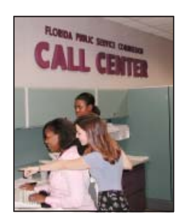
The FPSC handles complaints and inquiries related to such issues as service reliability, billing accuracy, service requests, and safety standard compliance.

The FPSC intends that disputes between regulated companies and their customers be resolved in a fair and efficient manner. The Commission's Transfer Connect system is one way it resolves a portion of the consumer complaints the Commission receives. When a consumer calls the FPSC's toll-free telephone number (1-800-342-3552) with a question or a complaint regarding utility services, a FPSC staff member, with the customer's approval, will transfer the call directly to the utility for its handling. Once the consumer's call is transferred, the utility pays for the call until completion. Each company that subscribes to Transfer Connect must provide live customer service personnel to handle the transferred calls. Consumers benefit when they can have all of their needs met with a single toll-free call. The Transfer Connect option also enables FPSC staff to consult with a utility representative and pass on information about the caller without the caller needing to repeat the information.