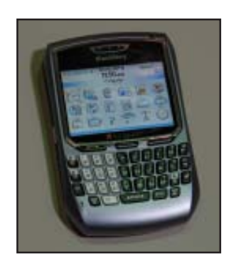
The FPSC has been reviewing both existing and emerging Internet access technology and backbone infrastructure.