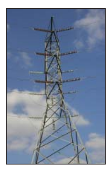
A reliable electric grid is a keystone for economic stability and growth as well as a necessity for Florida's population.

On January 23, 2006, the Commission held a staff workshop to review damage to electric utility facilities resulting from the 2004 – 2005 hurricane seasons, and to explore ways of minimizing future storm damage and reducing outages to