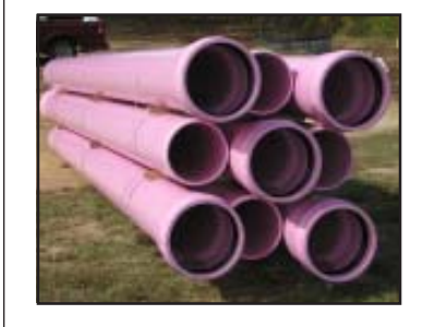
Contractors use "purple pipes" when installing a system for effluent water reuse. The pipes, valves, and outlets are color coded so utility personnel can easily identify what type of liquid is inside the pipe.