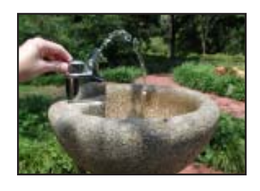
Conserve Florida explores ways to implement cost-effective conservation.

In addition to the large rate case load, staff performed the normal surveillance activity during 2006 of all 170 utility companies regulated by the Public Service Commission. The Commission also processed 59 index applications and 38 pass-through applications for water and wastewater companies.