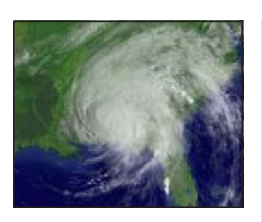
The Florida Public Service Commission is exploring ways to minimize future storm damage and reduce outages to customers.

customers. A number of regulatory actions followed. On February 27, 2006, the Commission required investor-owned electric utilities to take the following actions: 1) implement an eight-year wood pole inspection cycle; 2) provide a Hurricane Preparedness Briefing at the Commission's June 5, 2006, Internal Affairs Meeting; and 3) initiate rulemaking to adopt construction standards more stringent than the National Electric Safety Code and identify areas and circumstances where distribution facilities should be constructed underground. The Commission also directed its staff to file a recommendation proposing that Florida's electric utilities file storm preparation and hardening plans by June 1, 2006, containing ten specified storm hardening initiatives, such as a three-year vegetation management cycle program for all distribution circuits.