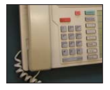
Commission staff monitor service quality through on-site evaluations and periodic reports filed by the companies.

From January through September 2006, BellSouth credited customers $1,355,200 for out-of-service repairs that extended beyond 24 hours. BellSouth also credited $177,950 to customers for not providing initial service to residential customers within three days. During a service evaluation, staff found that the company was not appropriately issuing automatic credits. Therefore, in Docket Number