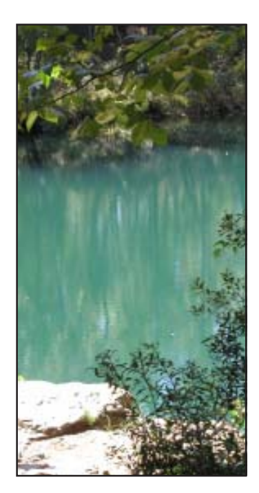
The Florida PSC, the Department of Environmental Protection, and the five Water Management Districts are coordinating efforts to meet statewide conservation goals.

Water conservation is another area with major economic implications. As an economic regulator, the FPSC is actively involved in demand-side water conservation through rate level and rate structure review. Rates and rate structure have a direct bearing on water usage and, therefore, water resource allocation. The FPSC has a Memorandum of Understanding with the DEP and the five WMDs in order to coordinate efforts to advance statewide water quality and meet statewide conservation goals. Both agencies are frequently called upon to testify on water quality and conservation issues in rate cases before the FPSC. Whenever feasible, the FPSC allows utilities to recover expenses related to conservation programs, and establishes conservation rates to reduce water consumption.