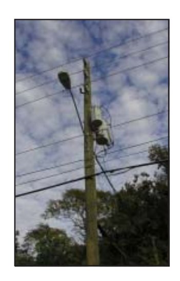
The Commission required the electric investor-owned utilities to provide support for their wood pole inspection plans.

In an effort to encourage renewable energy resources, the 2005 Florida Legislature enacted section 366.91, Florida Statutes. The statute requires the FEECA (Florida Energy Efficiency and Conservation Act) utilities to continuously provide a contract for purchasing capacity and energy from renewable energy resources. The Commission directed the investor-owned utilities to file standard offer contracts for renewable energy providers based on a portfolio of generating unit types. The Commission's approval of the standard offer contracts was appealed by a group of industrial cogenerators, making the tariffs unavailable and preventing other renewable generators from taking advantage of standard offer contracts. Rather than acting on the proposed tariffs, the Commission decided first to pursue proposed revisions to its standard offer contract rules to codify the Legislature's intent to encourage renewable generation. The Commission held a hearing on the proposed rule in November 2006, and adopted a final rule on January 9, 2007. In January, 2007, the Commission will conduct a public workshop to investigate how to facilitate the development of additional renewable generation. The Commission will also continue its ongoing efforts to gather data on renewable energy developments in the state as part of the Ten-Year Site Plan process.