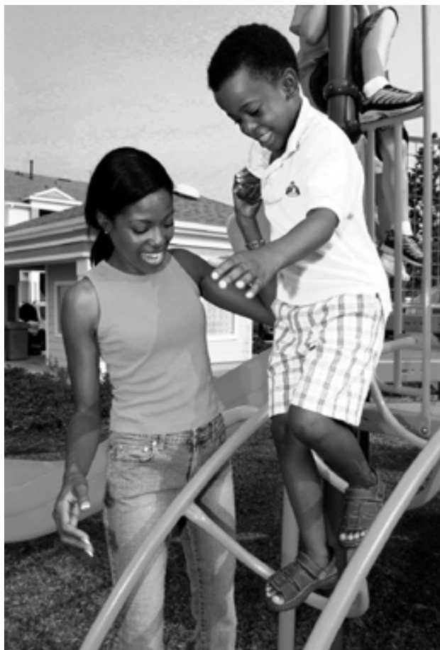
The Glenn on Millenia Boulevard, Orlando

Bond cap allocation through the U.S. Treasury