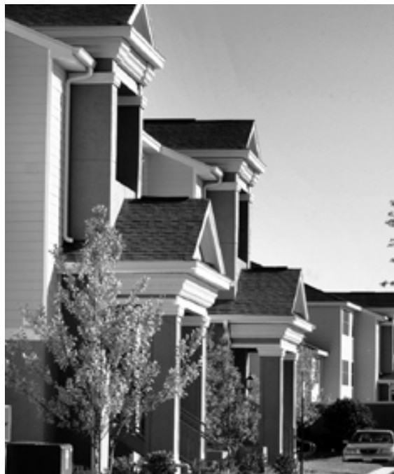
The Landings on Millenia Boulevard, Orlando