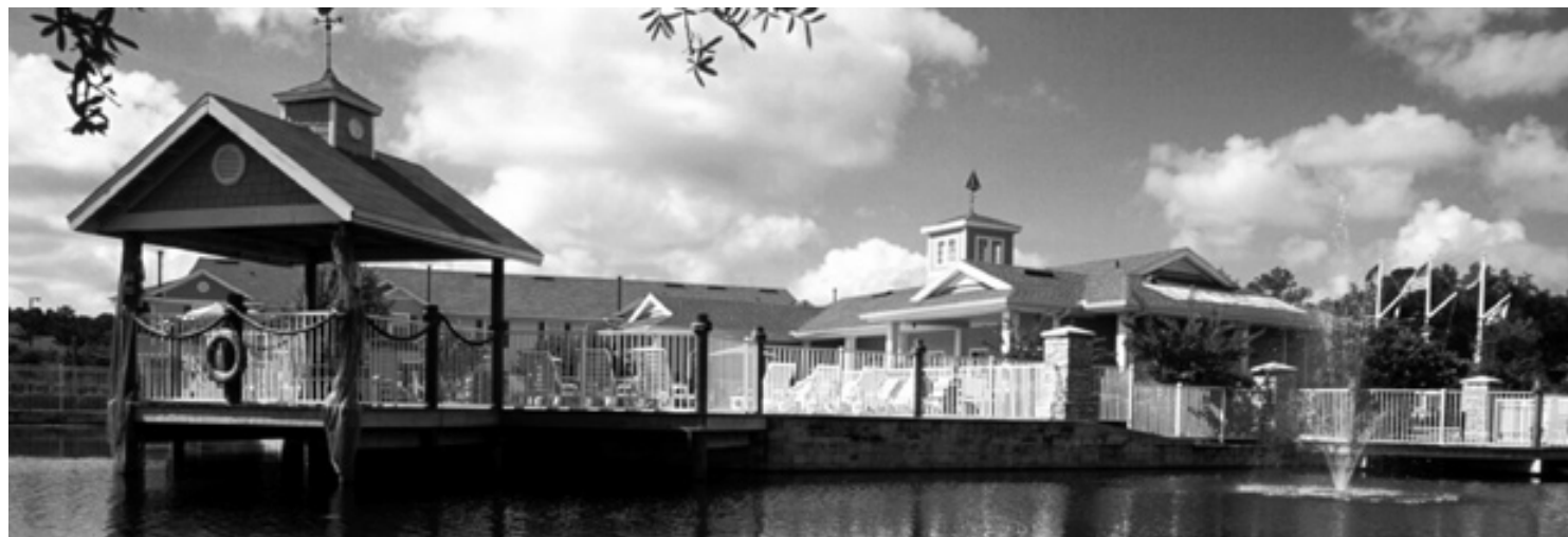
Hatteras Sound Apartments, Sanford

Federal tax credits from the U.S. Treasury