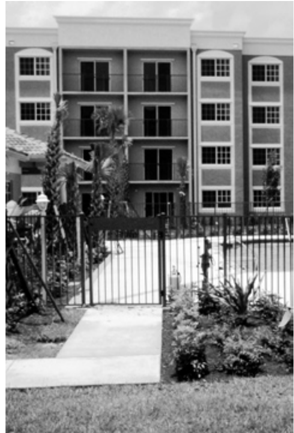
Colonial Park Apartments, Margate

U.S. Department of Housing and Urban Development