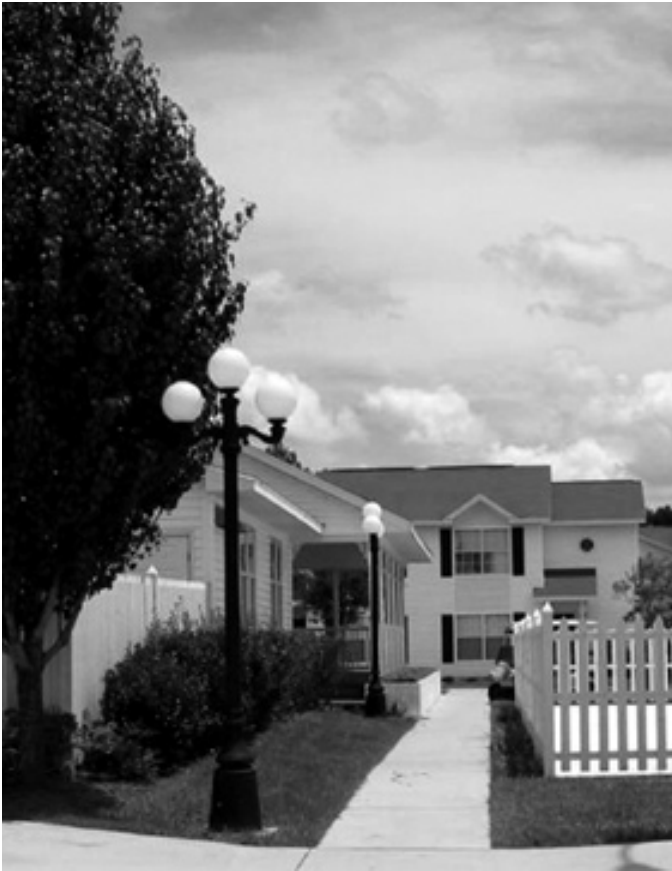
Green Gables Apartments, Ocala